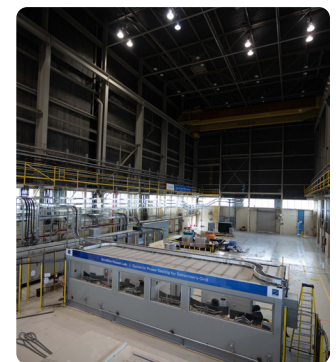
GridSim Power Lab

“ Safety is Our Culture | Quality is Our Promise ”