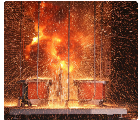
High Current Laboratory