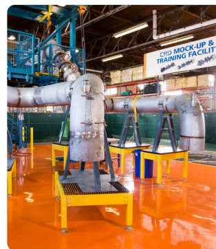
CRD Mock-Up & Training Facility