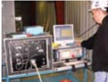
MV / LV cable insulation testing

Assessment services for MV and LV power cables, I&C cables, signal and control, telecommunication, and grounding cables employ several methodologies and, combine historical data with diagnostics to arrive at the condition of installed cables.