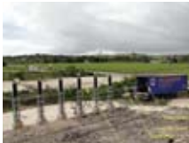
Kinectrics' mobile Resonant Test System (RTS)

Hi-Pot qualification and "proof of function" tests on HV power cables are performed using Kinectrics' mobile Resonant Test Sets (RTS) rated 260 kV at 83 amps for transmission class cable lines. Kinectrics operates 4 RTS units and provides testing capabilities for up to 500 kV cable systems at 1.7 U 0 as per IEC 62067 and IEC 60840.