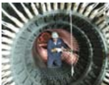
Rotating machines stator testing

HV generator and motor services include inspection, diagnostic testing, condition assessment and component type testing. Comprehensive lab and on-site testing and consulting services are provided by qualified industry specialists.