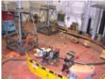
Overhead view - cable testing in HV Lab

Solutions developed and applied by Kinectrics support cost-effective asset management practices for utilities and other power industry clients. The experience we bring will help directors, managers and engineers determine and justify the best options for successful management of transmission, distribution, and generation assets.