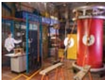
Live-line tool safety testing

HC Lab test areas include a reinforced concrete test cell for destructive type testing, a 200 ft. outdoor test span with reinforced towers for line hardware, and an indoor area for temperature rise tests. Modern multi-channel recording and professional video systems provide a detailed record of HC lab test programs and procedures.