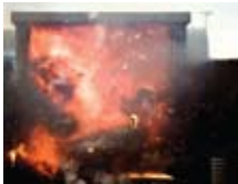
Outdoor testing cell in HC Lab