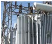
Distribution station equipment

Proven expertise and experience to optimize infrastructure utilization, maintain assets, and extend equipment life for utilities and other power industry clients.