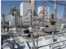
In-situ transformer testing

Comprehensive condition assessment and asset support services, including technical studies, testing, and expert consulting