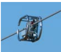
LineVue® inspection tool

Mechanical testing and field inspection services cover conductors, connectors, accessories and fibre optic cables. Kinectrics' high temperature, qualification, performance testing capabilities, and specialized studies can help manufacturers and asset owners minimize loss and maximize component life.