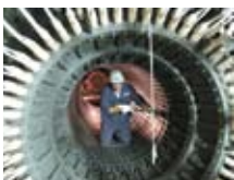
Rotating machines stator testing

HV generator and motor services include inspection, diagnostic testing, condition assessment and component type testing. Comprehensive lab and on-site testing and consulting services are provided by qualified industry specialists.