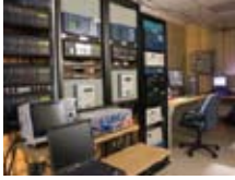
Real Time Digital Simulator (RTDS)

Kinectrics operates an IEC 61850 Interoperability Lab, which supports all major manufacturers of substation automation equipment. A Real Time Digital Simulator (RTDS) system is used to emulate the electric grid and allow for testing of multiple components as they would be configured in an actual substation.