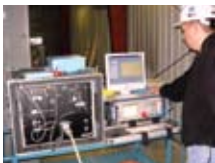
MV / LV cable insulation testing

Assessment services for MV and LV power cables, I&C cables, signal and control, telecommunication, and grounding cables employ several methodologies and, combine historical data with diagnostics to arrive at the condition of installed cables.