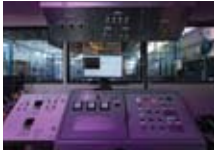
GRIDSIM Power Lab