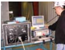
MV / LV cable insulation testing

Assessment services for MV and LV power cables, I&C cables, signal and control, telecommunication, and grounding cables employ several methodologies and, combine historical data with diagnostics to arrive at the condition of installed cables.