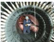
Rotating machines stator testing

HV generator and motor services include inspection, diagnostic testing, condition assessment and component type testing. Comprehensive lab and on-site testing and consulting services are provided by qualified industry specialists.